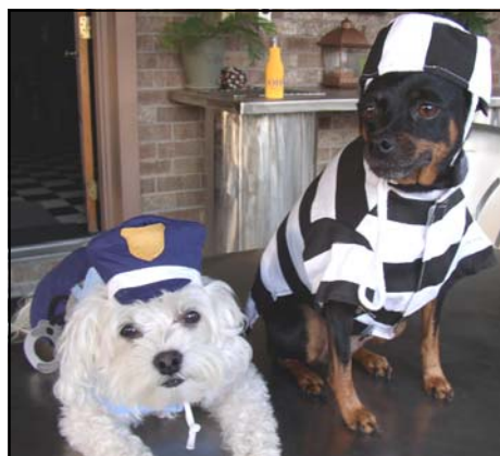
“Caesar” and “Xena”