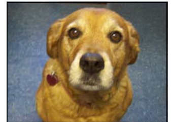
“Simba”, owned by the Joseph family

Certain symptoms or changes in behavior can indicate a variety of health issues, including diabetes, arthritis, dental disease, thyroid disease, cancer, and diseases of major organs such as the kidneys, liver, and heart. Because these health problems can arise before any symptoms start, we now draw blood for basic labwork at your geriatric pet’s yearly visits. This bloodwork tests the function of many major organs such as the liver and kidneys and can determine whether your pet is in the early stages of certain diseases that are more common in older animals, which can possibly make treatment easier and less invasive. If tests are