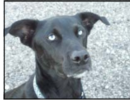
"Sky", owned by Lesley Robb

In order for your dog to receive this injection, it is required to perform basic bloodwork to check major organ function like the liver and kidneys, as well as evaluate your pet's heartworm status. This can be done along with your pet's yearly visit or can be scheduled as a separate appointment. This injection also cannot be given within 30 days of your animal receiving vaccinations. If you decide you are interested in