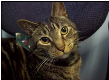
“Mittens”, owned by Northwoods Vet Clinic

With advances in veterinary medicine over the years, pets today are living longer and longer lives. Unfortunately, as they become older they are at a higher risk for a variety of health issues and there may be more that is required of you as a pet owner to ensure that they are in the best of health. At our clinic, we consider animals over the age of 8 to be geriatric. As your pet approaches this age and beyond, there are a few things you should be observing a little more closely as they can be key indicators of common geriatric health problems. These things include: